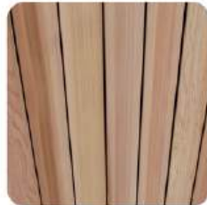
Western Red Cedar